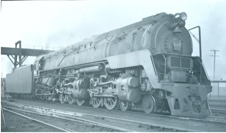
PRR Q2 #6179. Crestline assigned locomotive. @ Crestline or Chicago. Photo credit not known.